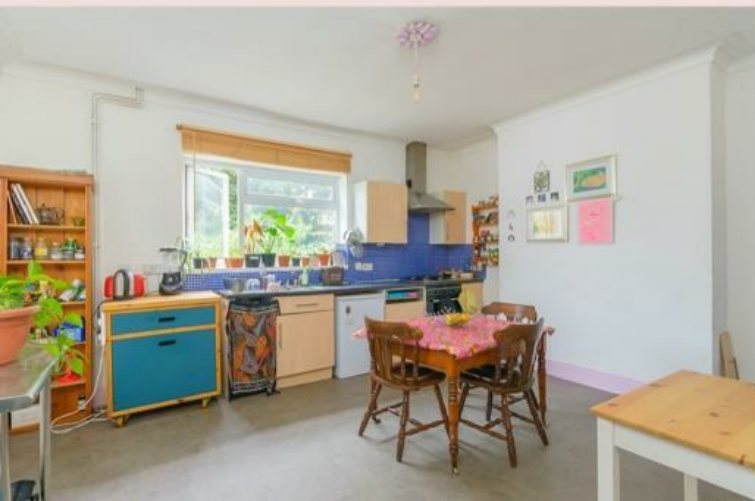
GROUND FLOOR 472 sq.ft. (43.9 sq.m.) approx.